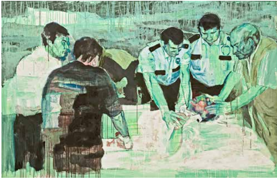
Aslı Torcu Circumcision, 2011 Mixed media on paper 144x222 cm