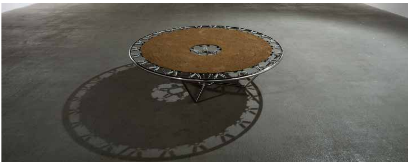
Ayman Yossri Dayban Terra Infirma, 2014 Stainless steel, silicone, sand d: 150 cm