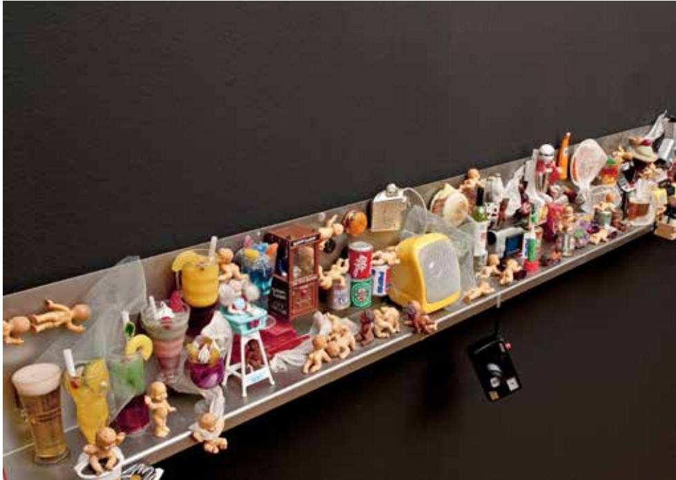
İpek Duben Children of Paradise, 2000 Metal, magnets, cloth, paper, sound 300x18x9 cm