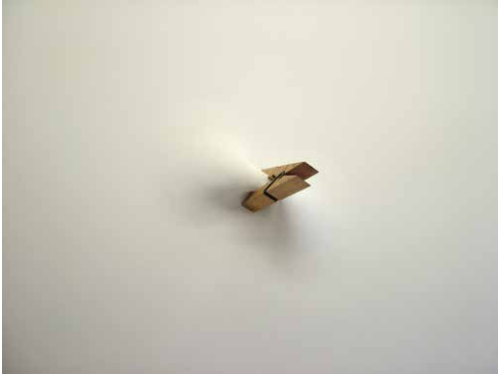
Mehmet Ali Uysal Skin, 2004 Plaster, wood Variable size