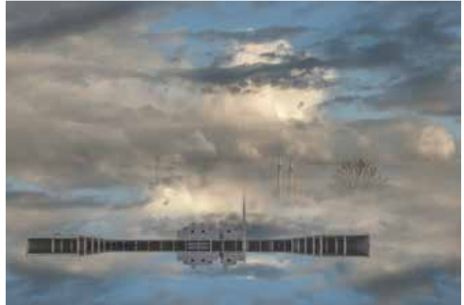
Sami Al Turki Ubhur Store Front II, 2013 Pigment print 120x180 cm