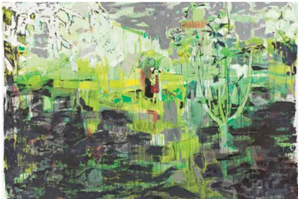
Aslı Torcu Underground, 2013 Mixed media on paper 139x197 cm