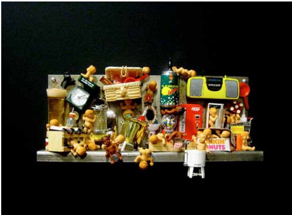
İpek Duben Children of Paradise, 2011 Metal, magnets, cloth, paper 17x37x11 cm