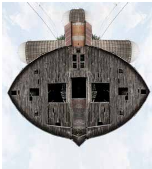
Sami Al Turki Chatem Barn, 2013 Pigment print 120x130 cm