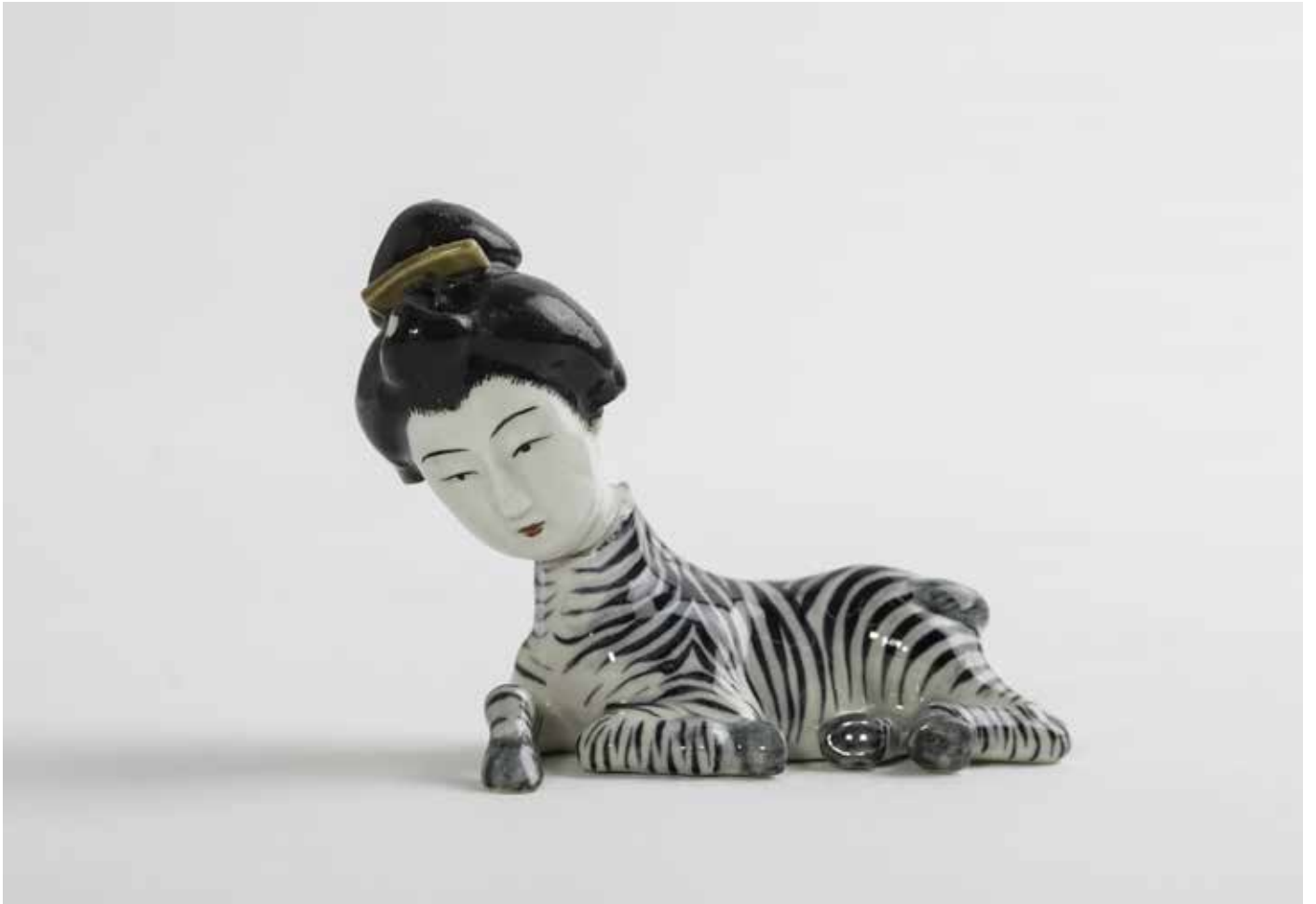
Volkan Aslan Peaceful Shades, 2014 Found porcelain and ceramics statuette 10x4x10 cm