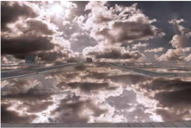
Sami Al Turki Ubhur District, 2013 Pigment print 120x180 cm