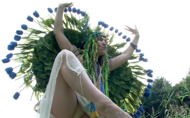
Melanie Bonajo, Matrix Botanica - Biosphere above Nations , 2013